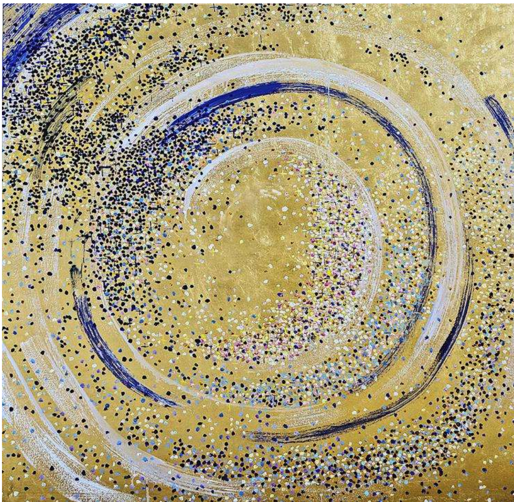
'Wheel of Fortune'