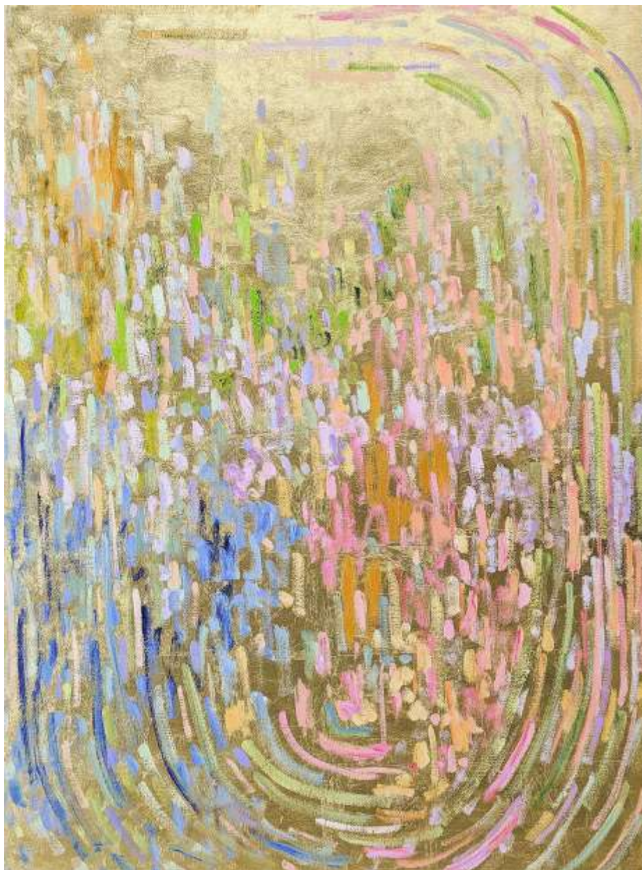
'The Lovers' '